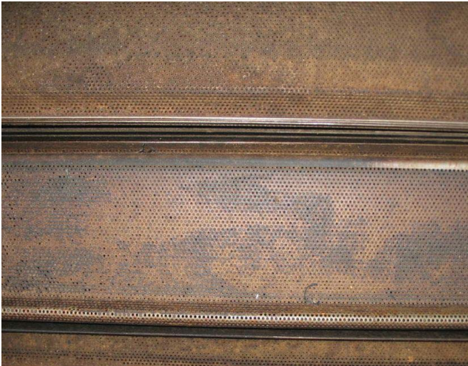
Examples of pans that are blocked off because product fines have built up in the perforated holes.

Every dryer—from the most basic to the most sophisticated—requires good maintenance practices to gain efficiencies . Frequently, we encounter situations where the operator is required to periodically increase the drying temperatures (for no apparent reason) because he is not able to dry their product. Trays or pans that have perforated holes (especially smaller perforations) tend to build up and blind off over time (see photos). If buildup