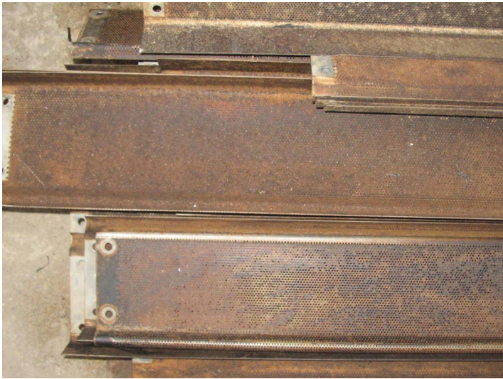
If buildup in the holes is present, the trays need to be cleaned to gain back the air circulation that was lost.

in the holes is present, the trays need to be cleaned to gain back the air circulation that was lost. To determine if this is the case, hold a light under the tray and look down through the tray.