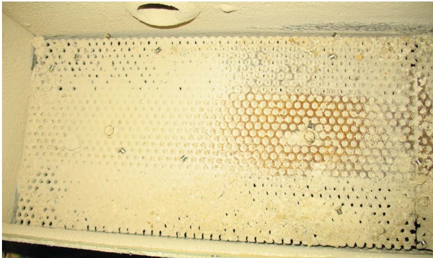
This is an example of a burner (taken apart) that was run without a filter over a long period.

Whenever dryer temperatures are elevated, sanitation becomes an important issue. Fines buildup inside the dryer—along with too high of operating temperatures—increases the risk of a potential dryer fire.