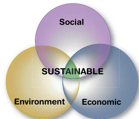
Figure 1. Illustration of the components of sustainability

and Griffin Industries LLC, under our shared DAR PRO Solutions brand, along with other companies in the rendering industry, are essential to protecting the environment and in addressing many social and economic issues. To say it simply, rendering is the essence of sustainability. (Figure 2).