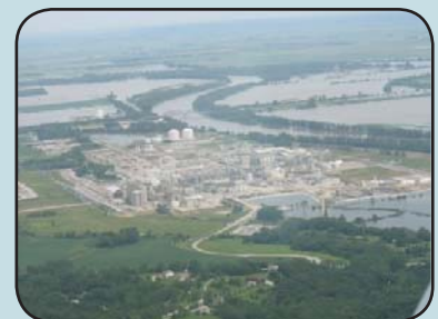
Cargill facility in Blair, Neb., along the Missouri River

plans in place to run a truck-only plant in the event of rail service loss. We continue to move forward with accelerated expansion plans and anticipate having additional volume on-line at our Dayton, Ohio, location in the next few months.