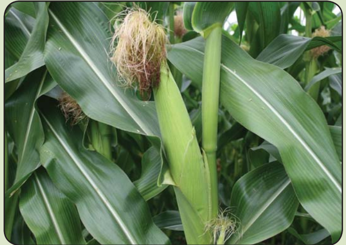
Compared to other grains and proteins, Empyreal® 75 has seen very little price movement.

At the eight to 10 leaf stage the plant is knee to waist high and shoots new leaves every two to three days. The root system is 18" deep and should be 15" across. The general rule of thumb (corn and beans) is that however tall the plant