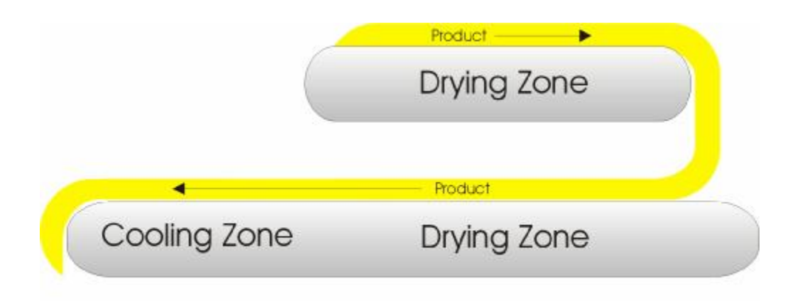
Figure1: Illustration of a combination horizontal dryer/cooler.

Horizontal coolers do not perform well when trying to cool post-fat coated pet foods due to the amount of free fat on the external surfaces of the food. The free fat, along with fines present in the product, will readily plug the perforations in the conveyor. Once the perforations are plugged, the airflow through the product bed is reduced, which will result in inadequate cooling. As a result, most new facilities, as well as many existing facilities, have switched to vertical coolers rather than horizontal coolers.