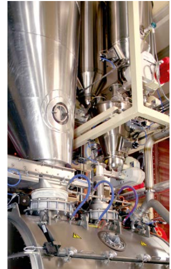
Coperion K-Tron screw feeders in a vacuum coating process