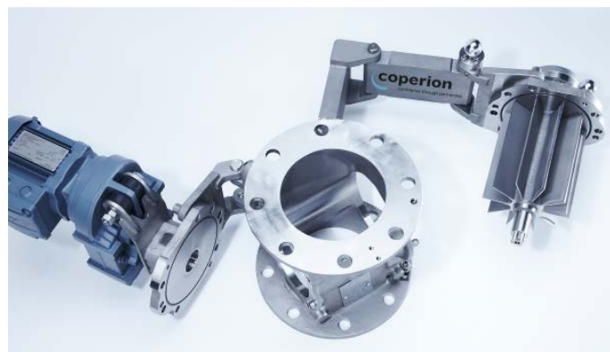
Coperion ZRD rotary valve with FXS extraction device