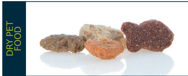
DRY PET FOOD

Clextral twin-screw extrusion systems produce innovative and cost-effective pet food and pet treats with animal and breed-specific characteristics that boost consumer appeal. With Clextral's technology, pet food makers can control all process parameters to tailor products for individual animals: crispiness, degree of hardness or suppleness, size, shape, moisture content, flavor, etc.