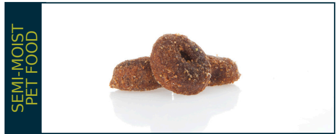
SEMI-MOIST PET FOOD