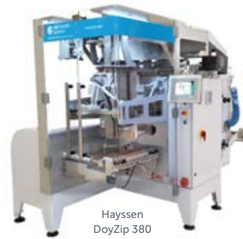
Hayssen DoyZip 380

Rose Forgrove Integra Horizontal flow wrapper packaging machine suitable for individual pet treats and specialty items; speeds up to 150 wraps/min.