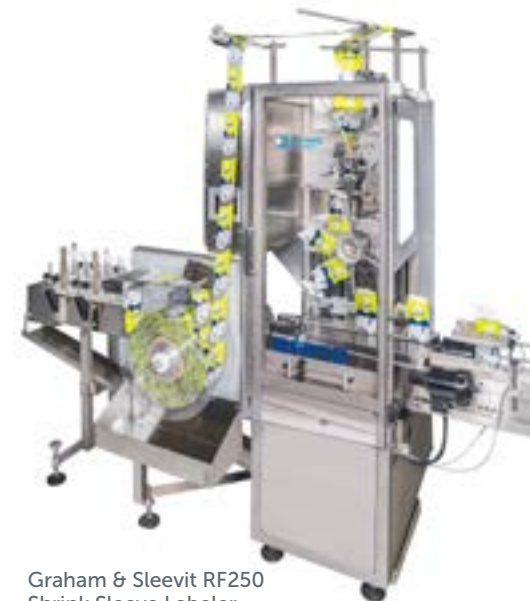
Graham & Sleevit RF250 Shrink Sleeve Labeler