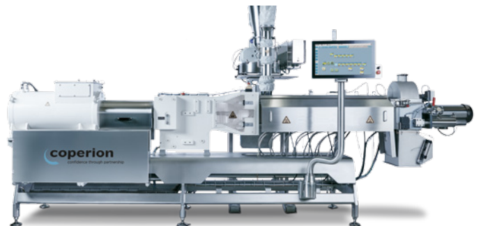
The Coperion ZSK MEGAvolume PLUS is especially suitable for the economical processing of dry and semi-dry dog and cat food and treats.

After all ingredients have been fed into the extruder, they must be mixed homogeneously. Usually this can be done by one or more mixing zones, which consist of combinations of different