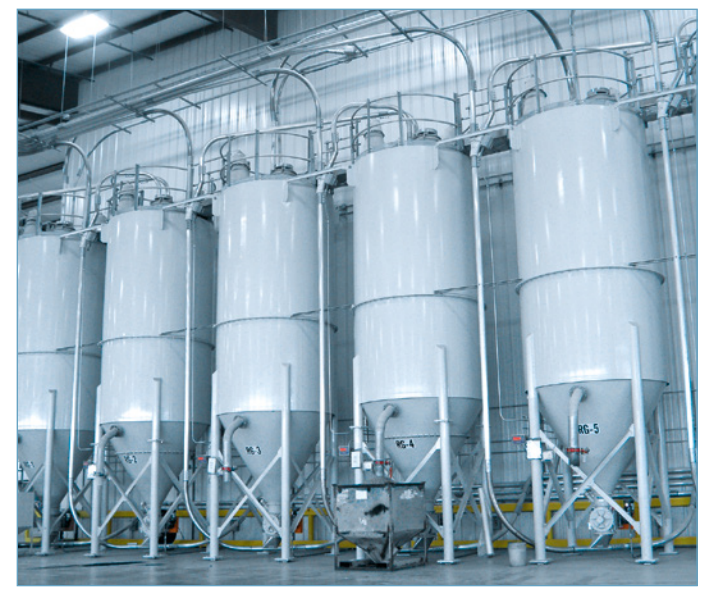
Coperion K-Tron pneumatic conveying system

In-line or off-line screeners are often used during the raw ingredient transfer process for