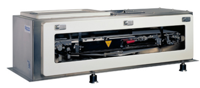
Coperion K-Tron Smart Weigh Belt (SWB) feeders are available in closed frame (shown) or open frame models.