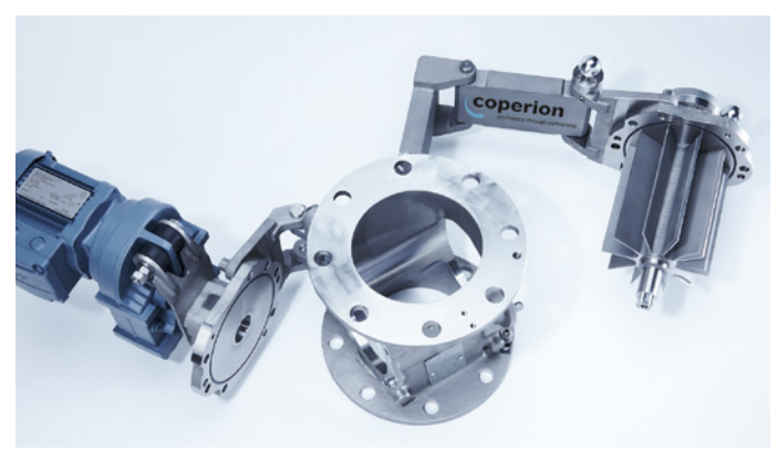
Coperion ZRD rotary valve with FXS extraction device