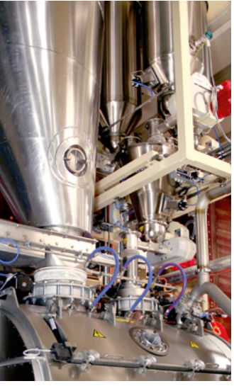
Coperion K-Tron screw feeders in a vacuum coating process