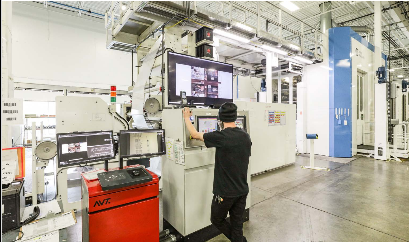
Printing/Laminating Facility – Plymouth MN