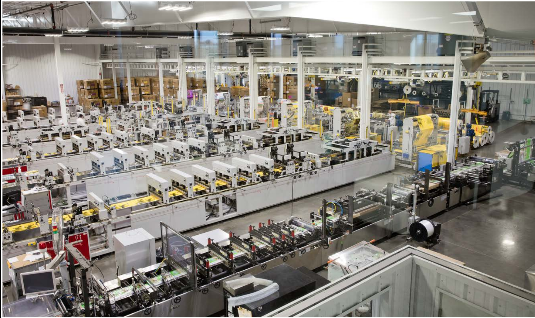
Converting Facility – Jefferson City MO