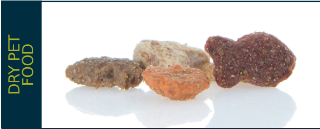
DRY PET FOOD

Clextral twin-screw extrusion systems produce innovative and cost-effective pet food and pet treats with animal and breed-specific characteristics that boost consumer appeal. With Clextral's technology, pet food makers can control all process parameters to tailor products for individual animals: crispiness, degree of hardness or suppleness, size, shape, moisture content, flavor, etc.