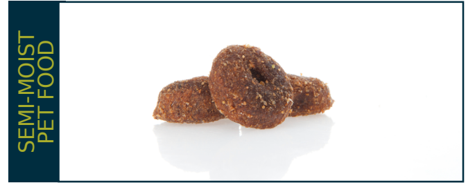
SEMI-MOIST PET FOOD