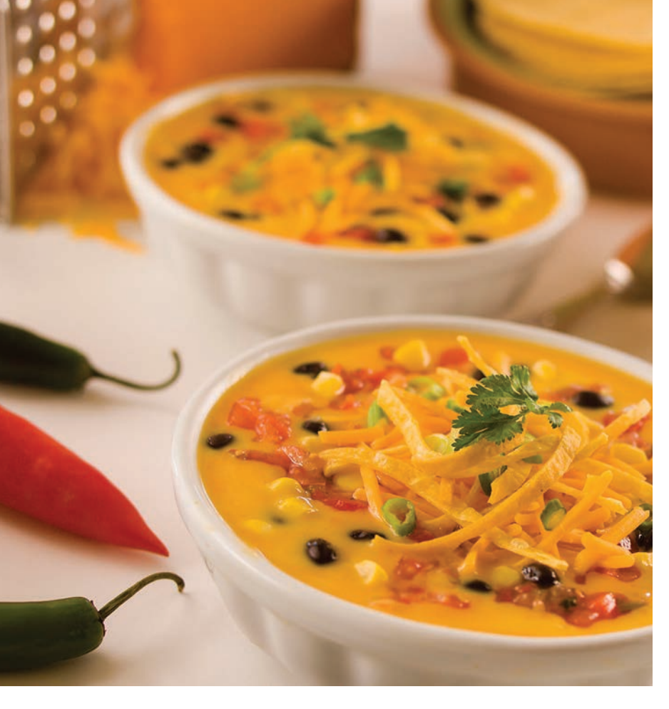
When you need to deliver rich flavor with minimal fat, Butter Buds is your partner in making the world a tastier place. Our concentrates generally contribute less than 0.1% fat to your finished product.