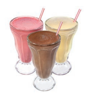
Low fat doesn't mean reduced flavor. Use Butter Buds for rich, delicious products.