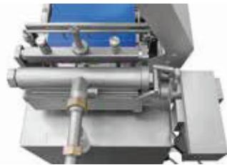
↑ FST 545 servo drive