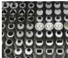
↑ Forming tubes