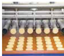
↑ Tray/rack application