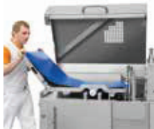
↑ Easy cleaning