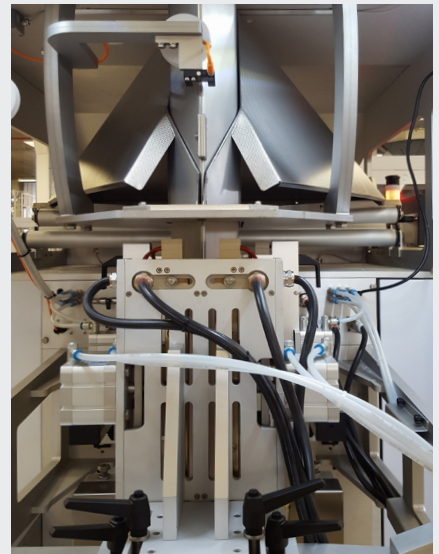
Vertical sealing and forming tube details

BW Flexible Systems 225 Spartangreen Blvd. Duncan | SC | 29334 UNITED STATES t. +1 (864) 486 4000 bwflexiblesystems.com