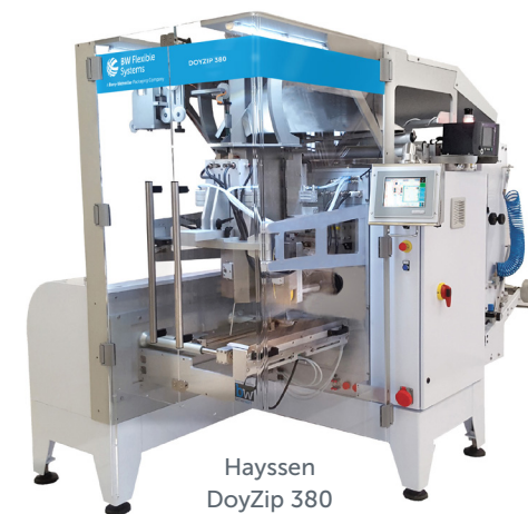
Hayssen DoyZip 380

Rose Forgrove Integra Horizontal flow wrapper packaging machine suitable for individual pet treats and specialty items; speeds up to 150 wraps/min.