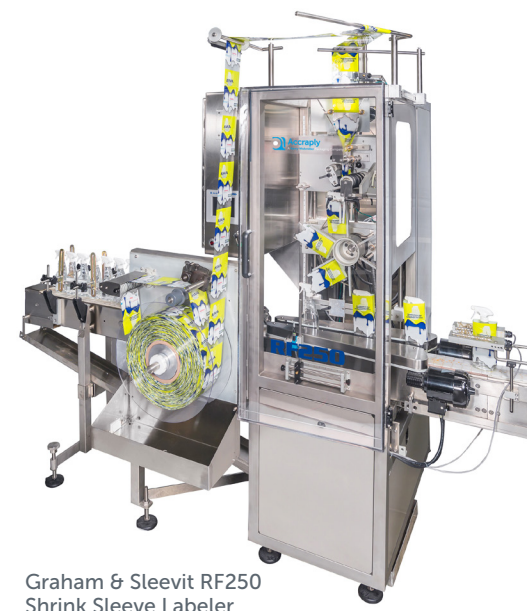
Graham & Sleeveit RF250 Shrink Sleeve Labeler