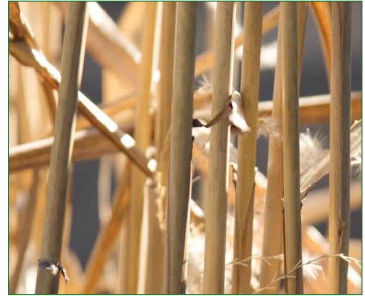
After all the nutrients have moved back into the soil, the cane is ready to be harvested at less than 15% moisture.