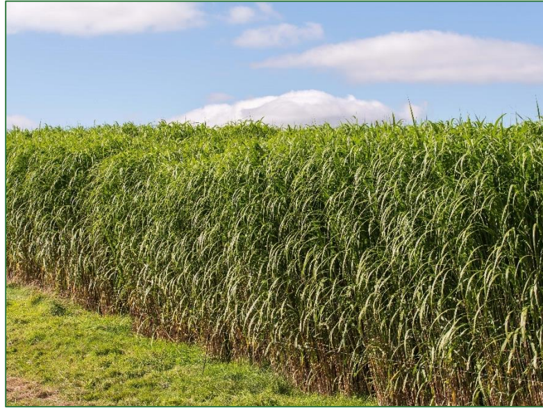
Crop purifies in the field through a selective growing process.