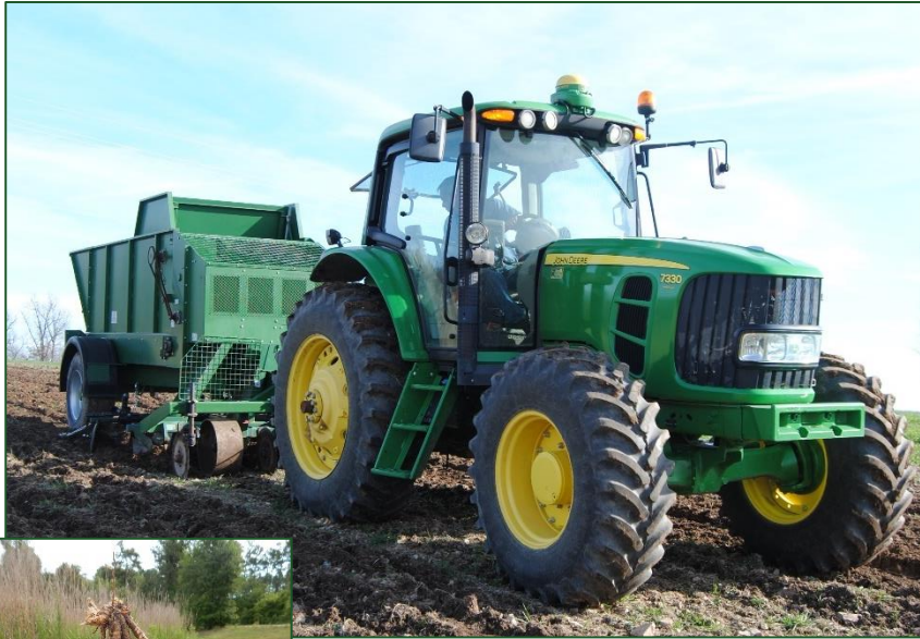
Rhizomes are planted.