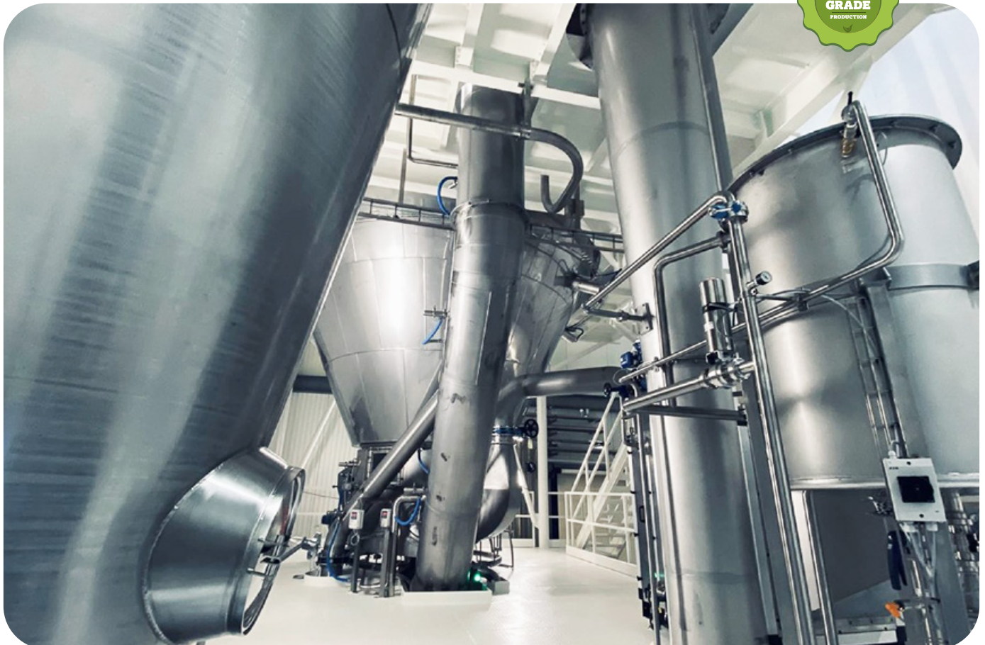
Fig 1. Low temperature spray drying ensures conservation of the valuable benefits and bioactivities

Due to the food grade status of raw materials and food grade processing, the Proliver chicken liver hydrolysate is nominated human grade.