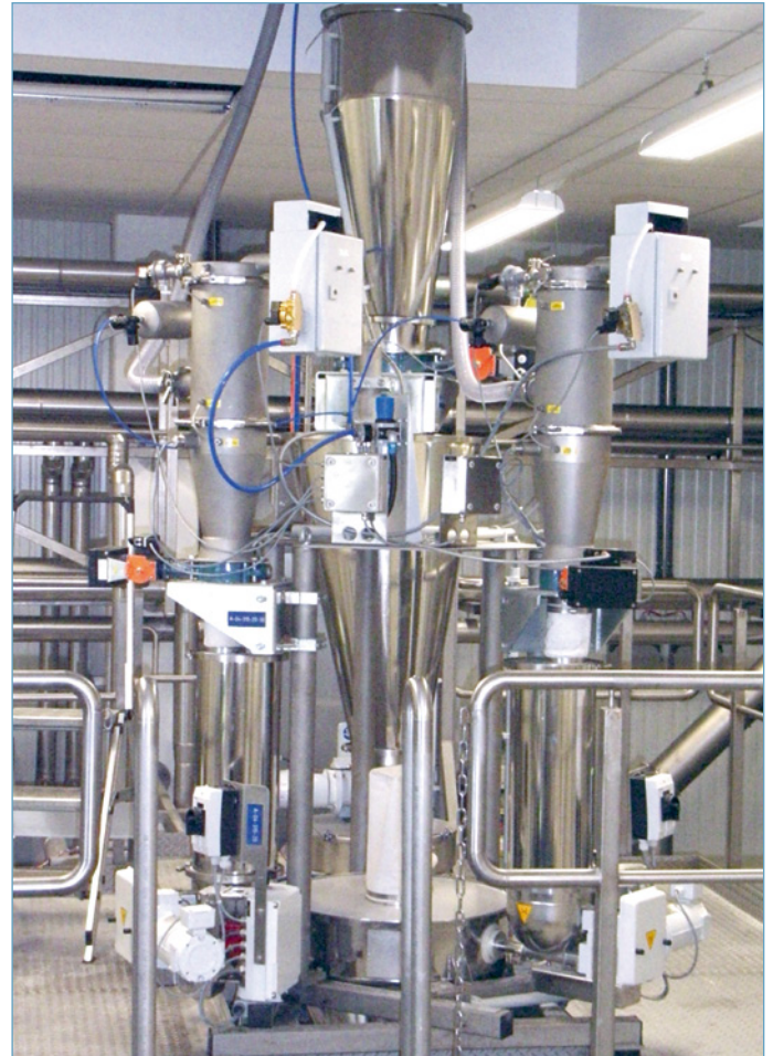
Fig. 4: Gain-in-weight batching system in a food application

Loss-in-Weight Batching LIW batching utilizing Coperion K-Tron high accuracy screw feeders such as those shown in Figure 4 provides a significant accuracy and process time advantage over traditional GIW batch techniques. LIW batching is used when the accuracy of individual ingredient weights in the completed batch is critical or when the batch cycle times need to be very short. Gravimetric feeders operating in batch mode simultaneously feed multiple ingredients into a collection hopper. Adjustment of the delivery speed (on/off, fast/slow) lies with the LIW feeder controls and the smaller weighing systems deliver highly accurate batches for each ingredient. Once all the ingredients have been delivered, the batch is complete and the mixture is delivered to the process below. Since all ingredients are being delivered at the same time, the overall batch time as well as further processing times downstream are greatly reduced. This method of batching is often used for high value ingredients due to the highly accurate requirement of their weight in the mix as well as their ingredient cost.