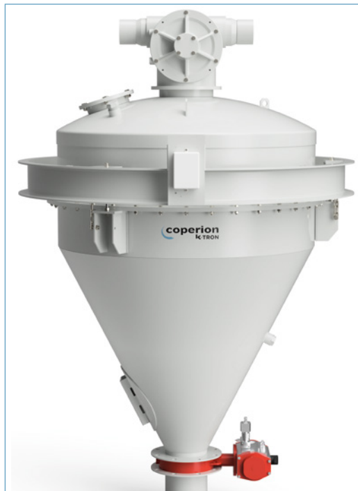
Fig. 3: Scale Hopper with Aeropass Valve at top

For additional information on pet food conveying methods, see our Technical Paper T-900011 'What Is the Best Pneumatic Transfer Method for My Pet Food Process'.