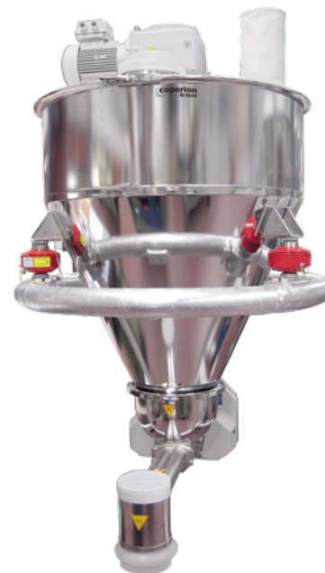
Fig. 6: T60 twin screw loss-in-weight feeder

For additional information and application information on extrusion, feeding and material handling for all pet food and pet treat processes, see www.coperion.com/food .