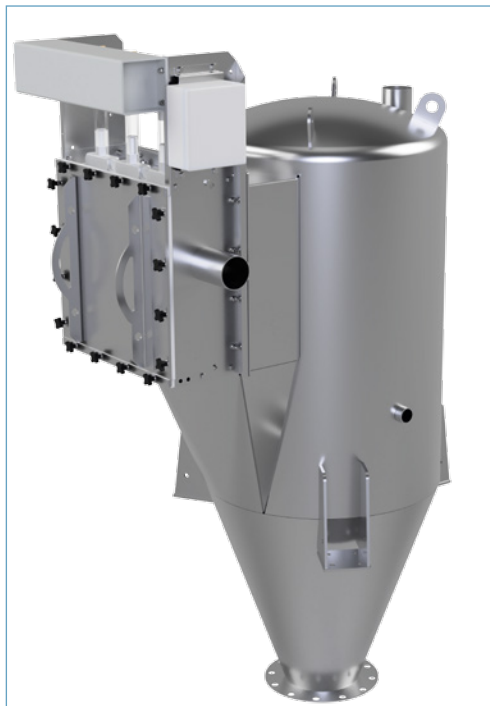
Fig. 2: Side Access Filter Receiver

Depending upon the volumes required, possible sources of ingredient delivery include boxes, sacks, bulk bags or super sacks. Pneumatic conveying systems can be used to transfer these ingredients in all steps of the process, utilizing either positive or negative pressure dilute phase conveying. Positive pressure conveying systems are typically used to transport bulk materials over long distances and at high throughputs. Applications which involve pressure conveying often include loading and unloading of large volume vessels such as bulk bags. Conversely, vacuum (negative