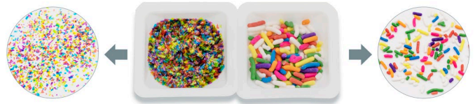
0.15g of EdiSparklz vs. 3g of sprinkles

on the right contains sprinkles. The weighboat with EdiSparklz only weighs 0.15g while the weighboat with sprinkles weighs a whopping 3g!