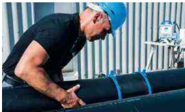
Slide both ends of the pipe into the fitting as far as the marking. Then remove the assembly aid.