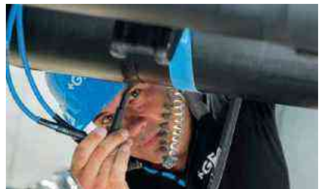
Connect the welding cables to the welding contacts of the fitting and weld according to the instruction manual.

Watch the installation tutorial video: www.gfps.com/cf4-installation