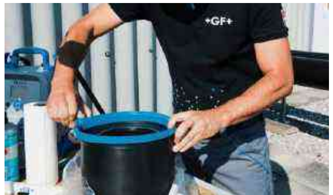
Place the assembly aid on the fitting. Stretch the sealing lip pressing the handles together.