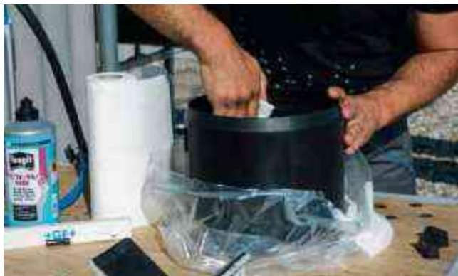
Clean the fusion zones of the fitting and pipe using Tangit PE-cleaner and a clean paper towel.

Even installers without any previous electrofusion experience find it easy to install COOL-FIT® PE Plus . We provide onsite training and certification free of charge.