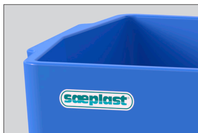
Complete and directed dumping.