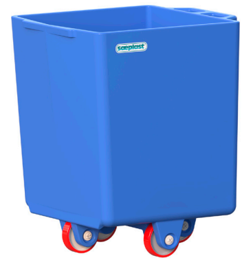
PE Sæplast PE MS301 Buggy without a bracket