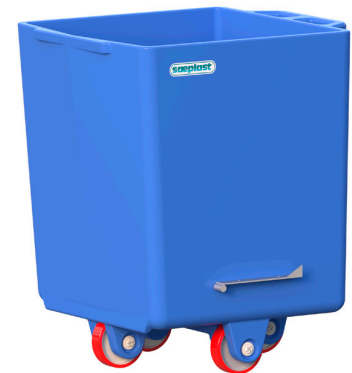
PE Sæplast PE MS300 Buggy with a bracket