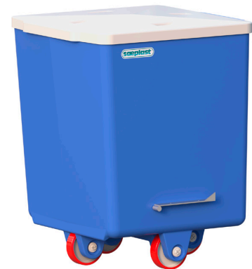
Both Sæplast PE MS300 and MS301 are available with lid