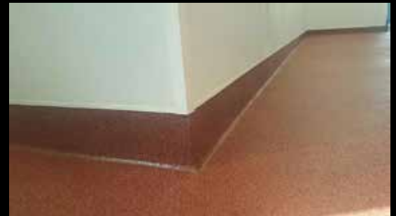
Integrated 4" or 6" Cove Base.